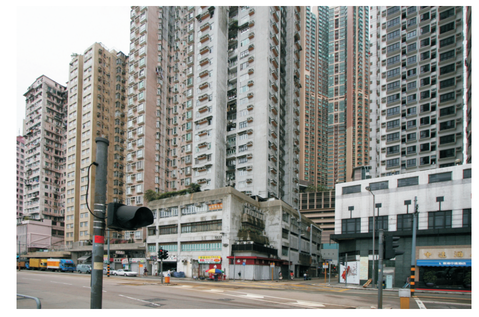
LCA1.2 City Grid Mixed Urban Landscape (University)