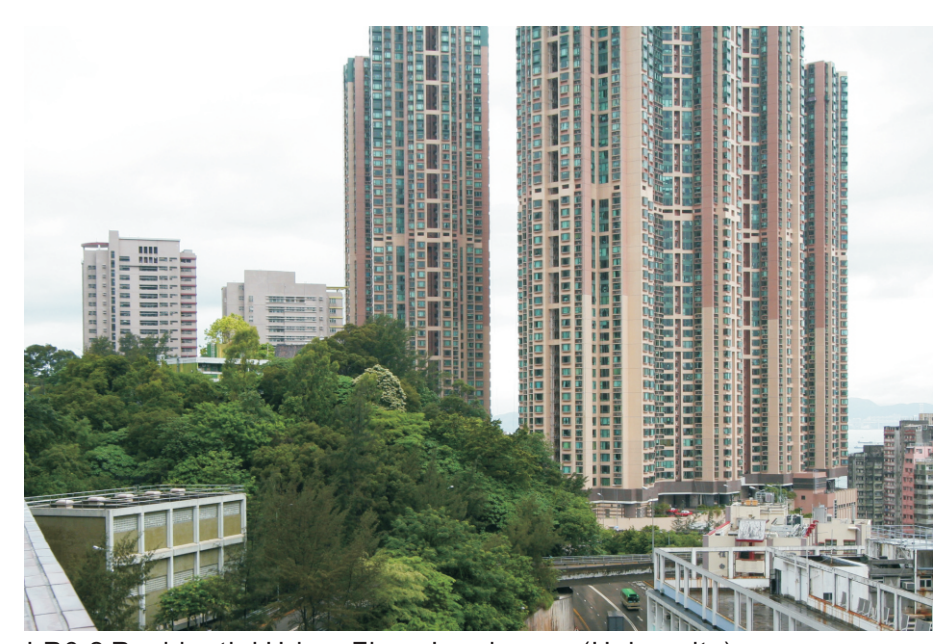
LR6.2 Residential Urban Finge Landscape (University)