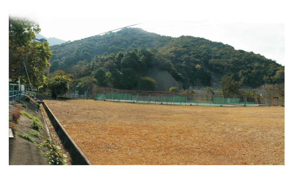
LCA2.2 Mix-Use Urban Fringe Landscape (University)